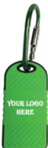
Imprint your logo on the back