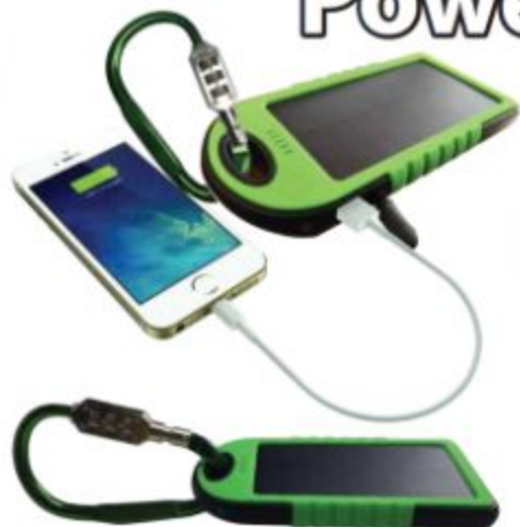
Water Resistant Solar Charger