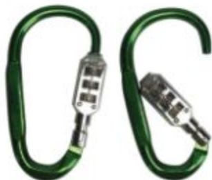
Combination Lock Carabiner