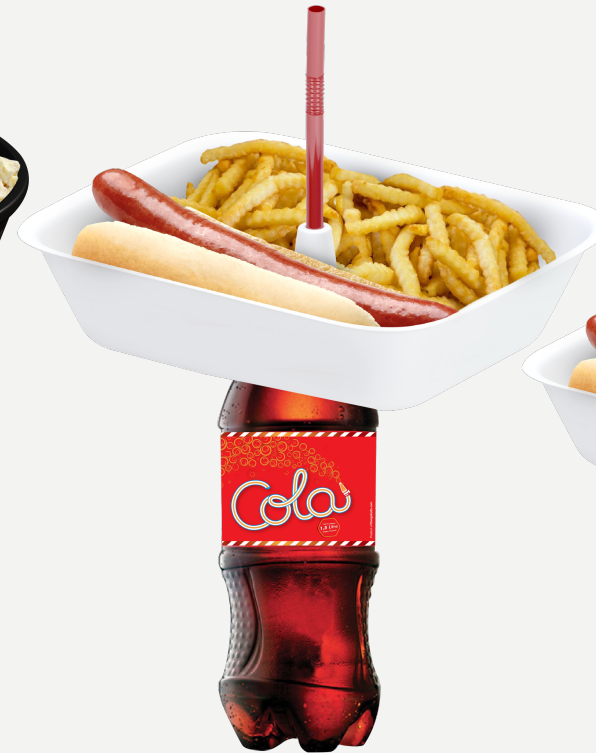
Soda & Water Bottles